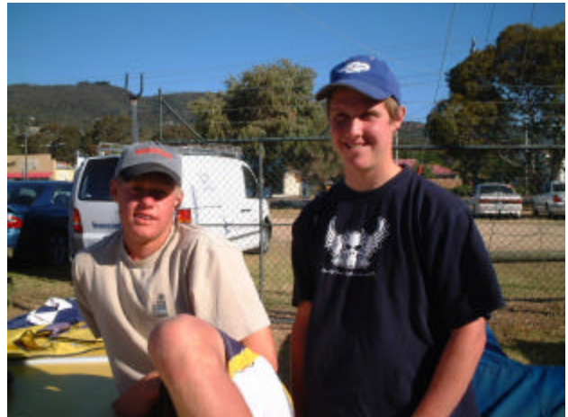
Real apprentices—McCrae YC